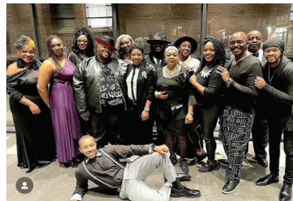
Cast of "GospelFest: Foluke in God's Hands"

"Developing Minds and Creative Expression Through Engaging Arts Activities"