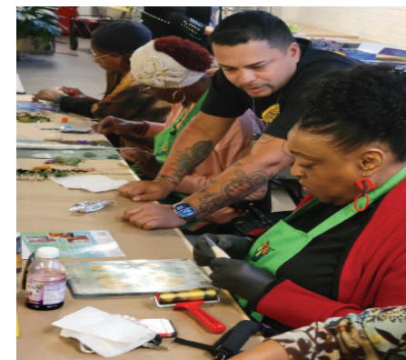
“Elder Blooms Flora Wisdom Botanic Imprints” Workshop for Seniors @ Future Ink Graphics (FIG) in the PIVOT Center