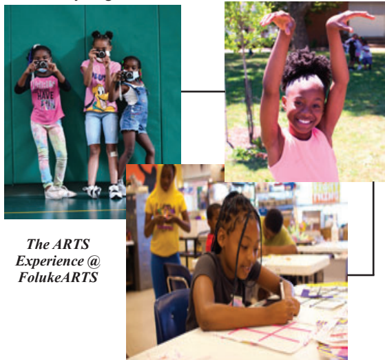
The ARTS Experience @ FolukeARTS

"The ARTS: One of the Most Valuable Tools for Building Relationships and Community