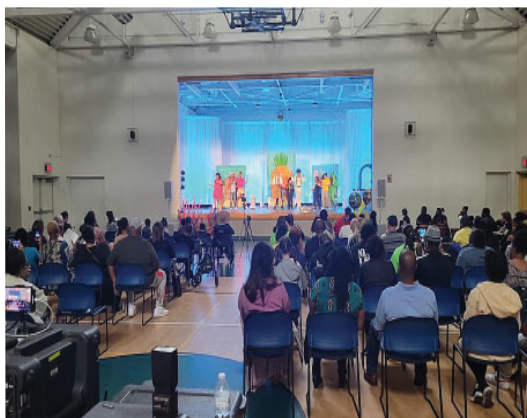
“SpongeBob Square Pants the Musical” @ Friendly Inn Settlement