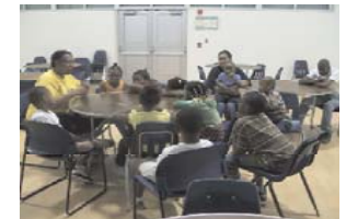
Story Telling at Friendly Inn Settlement House

Private contributions allow us to continue serving the Children and Youth of Cleveland. Your tax deductible donation is greatly appreciated. Make checks or money orders payable to Foluké Cultural Arts Center, and mailed to P.O. Box 93046, Cleveland, OH 44101-5046. Donations may also be made online at www.folukeculturalarts.org , All major credit/debit cards accepted.. Thank You.