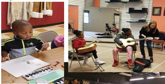
The ARTS Experience @ FolukeARTS