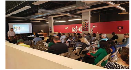
Cuayhoga Arts and Culture Prospective Grantee Orientation Meeting

"Developing Minds and Creative Expression Through Engaging Arts Activities"