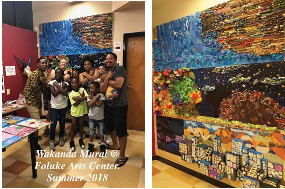
Wakanda Mural @ Foluke Arts Center. Summer 2018