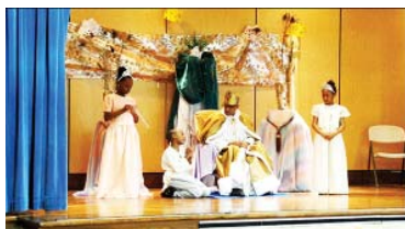
CMHA-Outwaite Presentation of "The Emperor's New Clothes"