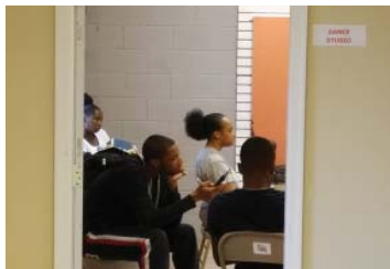
Teen Workshop @ FolukeARTS