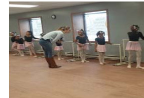
Ballet class at Foluke Arts Center Studio